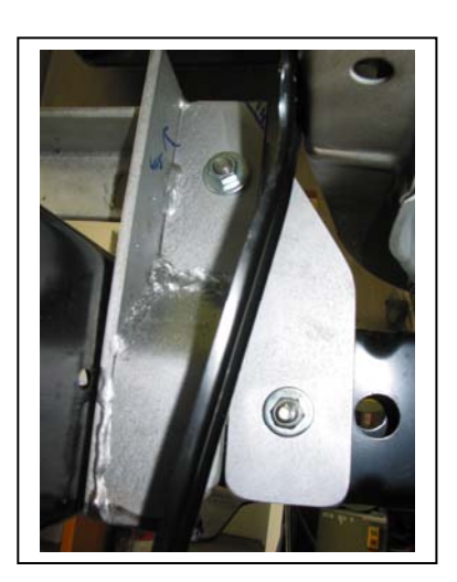
Figure 9 – Drivers side inside shown