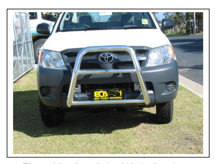
Figure 16 – 63mm Series 2 Nudge Bar shown