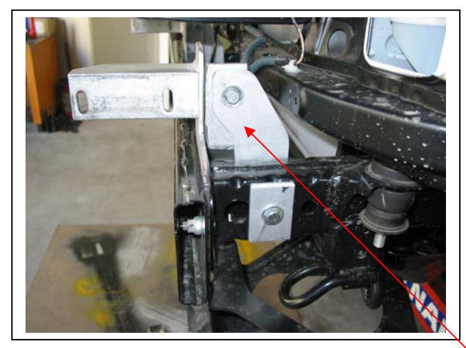
Figure 7 – Passenger side shown