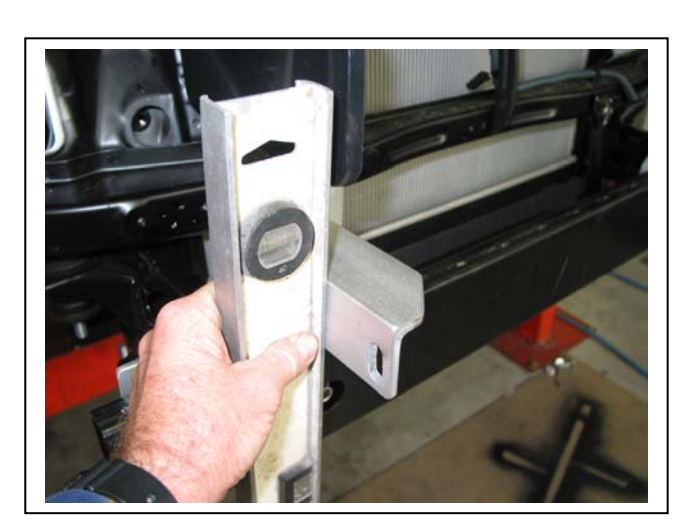
Figure 3 – Shown levelling drivers side steel mounting bracket