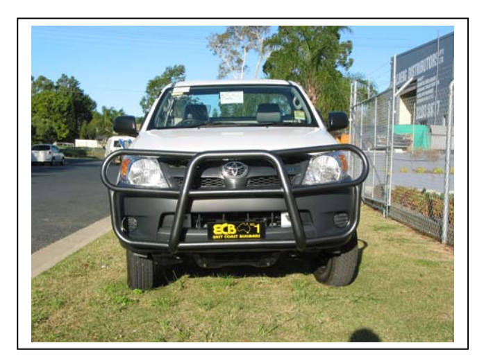
Figure 17 – Type 8 shown