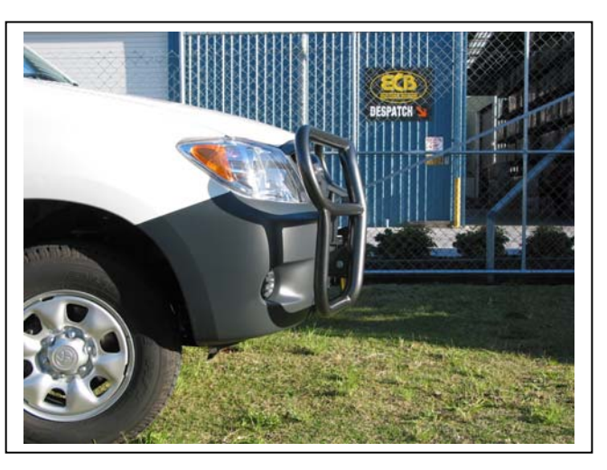
Figure 14 – Type 8 shown