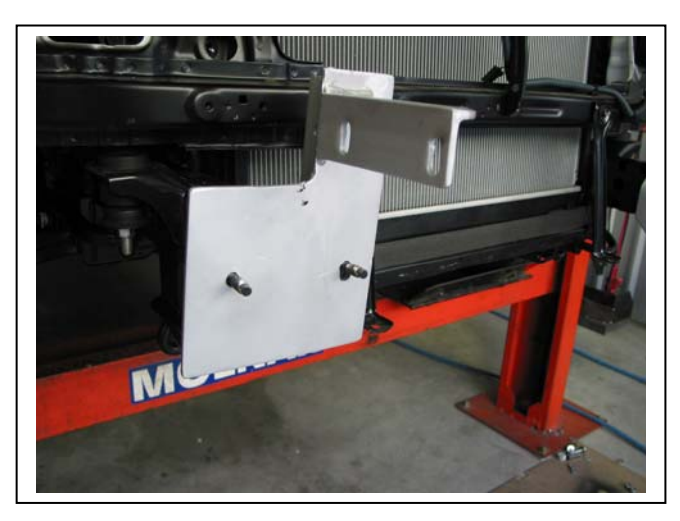
Figure 2 – Drivers side shown