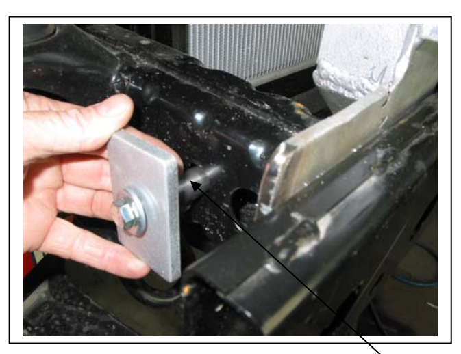
Figure 6 Steel pipe spacer