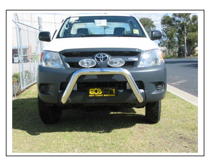
Figure 15 – 76mm Nudge Bar shown

29 Snook St Clontarf QLD 4019 Australia Po Box 122 Margate QLD 4019 Australia