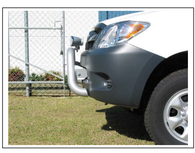
Figure 12 – 76mm Nudge Bar shown