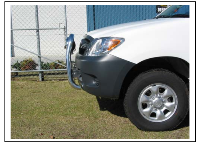
Figure 13 – 63mm Series 2 Nudge Bar shown