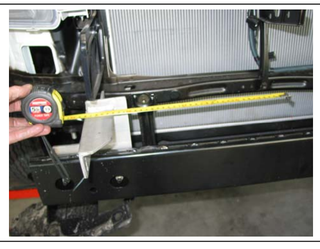
Figure 4 – Drivers side shown centralising steel mounting bracket